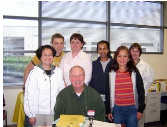
Club Officers Fall 2004

Visit the club's website at Student Life on SSCC's Homepage http://studentlife.southseattle.edu/clubs . http://studentlife.southseattle.edu/nsaids/nursingdept.html